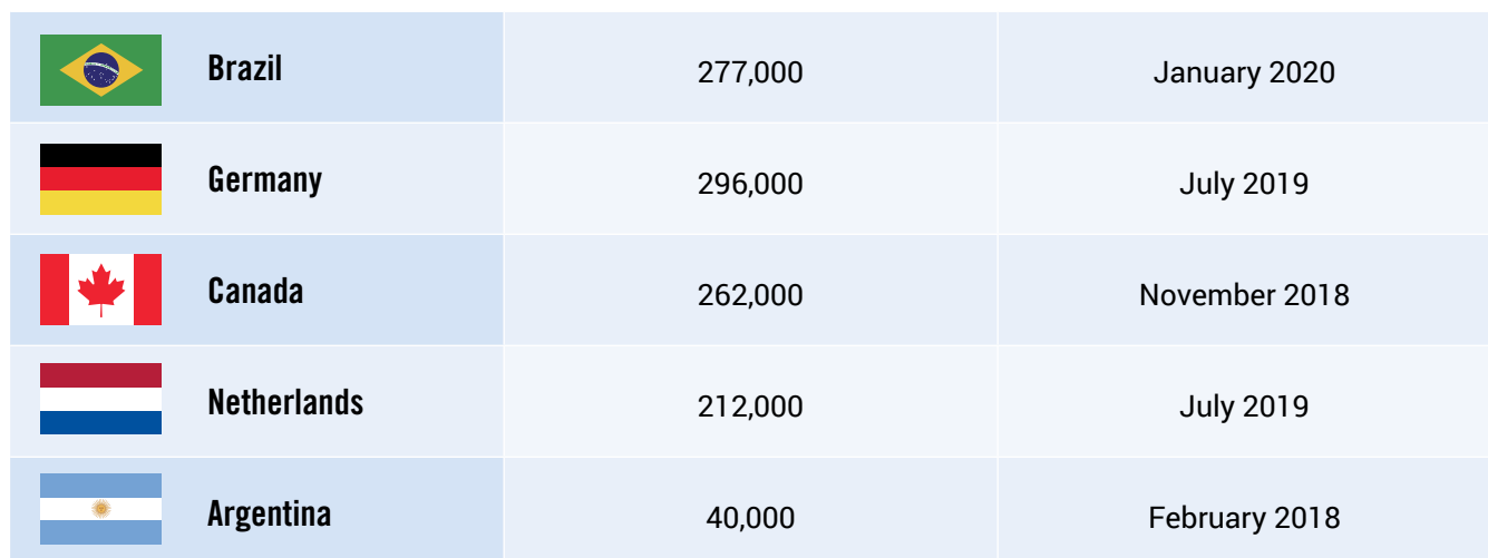
FIGURE 2: HOW BRAZIL'S APP ECONOMY COMPARES INTERNATIONALLY

Data: Progressive Policy Institute, indeed.com