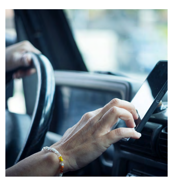
Platform work offers granular and immediate control over schedules — a plus for people with caregiving responsibilities.

Moreover, "within all occupational groups, mothers earned less per hour when they worked part-time rather than full-time." Most strikingly, "women working part-time in service occupations and sales and office occupations earned 75% of the earnings of their full-time counterparts, or 25 cents on the dollar less per hour."<sup>29</sup>